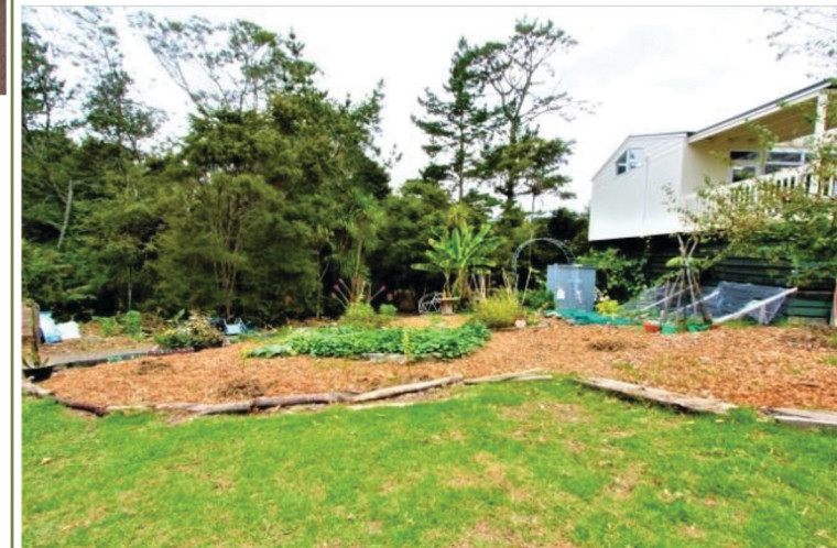
Part of the Wainui Primary School kitchen garden

For a nominal annual fee, the Garden to Table programme provides a great deal of support and also runs an annual competition – in which Wainui Primary won the Best Emerging School prize for their first year in 2018. As well as growing produce that is good for eating, and teaching pupils about the environment, Wainui Primary School is also very good at planting the seeds of learning and developing its pupils' appreciation of their place in the wider community.